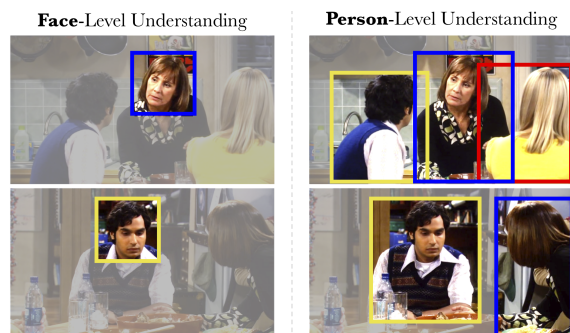
Figure 1: Video Person-Clustering – an essential step towards story understanding. Imagine trying to understand the story in the scenes above, given only the non-greyed-out parts. Face-level understanding (left) omits important information, such as characters with their backs turned. This work addresses the new task of video person-clustering, which develops person-level understanding (right) in a scene by clustering all people, regardless of if their faces are showing or not. This is in contrast to the more limited, established, task of face-clustering. Person-level understanding is essential for downstream applications of grouping-by-identity such as story understanding, and cannot be achieved by face-clustering alone.

However, methods for clustering by identity are almost