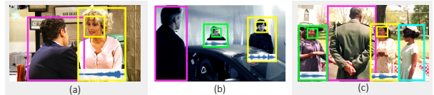
Figure 3: VPCD dataset. It consists of different and diverse TV shows and movies; here, we display a subset of them: (a) Friends, (b) Sherlock, (c) Hidden Figures. VPCD contains face, body and voice tracks annotated for many characters. Here, we display such examples. Each face-body pair is displayed with a unique color. A more representative range of characters are captured in a variety of scenes ( e.g. dark (b)), viewpoints ( e.g. (c)); and poses, including backs of bodies (magenta, cyan). When speaking, we also include a voice-track (blue signal below body-tracks).

In this section, we describe the dataset (Section 4.1), the annotation (Section 4.2), and the feature extraction processes (Section 4.3). The dataset is built on top of existing video datasets that have face-level annotations (labeled face-tracks) by adding and annotating body-tracks, and annotating voice utterances. This is for three reasons: first, it enriches the existing dataset by raising them to have person-level annotations; second, it enables comparisons on face-level clustering with prior work on these datasets; and third, it means that the video material is already publicly available and we need only release the new annotations (and features).