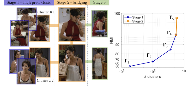
Figure 2: The clustering process of MuHPC. (Left) Example person-tracks at each stage of MuHPC. Two high-precision clusters from Stage 1 depicting the same character. One contains near-frontal faces (below) and one profiles (top), hence the single face modality cannot confidently merge the two. Stage 2 uses a talking person-track from each cluster to form a bridge, by demanding the agreement of both face and voice modalities that these contain the same identity. Stage 3 merges face-less bodies into the formed cluster. (right) The NMI and number of clusters at each partition, \Gamma , of stages 1 and 2 on an example video from VPCD. At each partition the number of clusters decreases, while the normalised mutual information increases. At \Gamma_4 Stage 1 clustering stops. Stage 2 progresses to \Gamma_5 by bridging clusters. Stage 3 does not affect the number of clusters.

Discussion. This stage results in K_2 clusters with high-precision, where K_2 \leq K_1 . Here, we use face and voice as they have been shown to be coupled [41, 42] and to contain redundant, identity discriminating information. An alternative is to require that the voice modality alone provides a confident ( i.e. tight threshold) match, e.g. two person-tracks